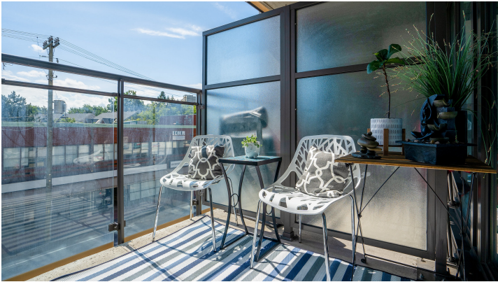
411 MACKAY STREET #308 - OTTAWA, ON

Dreaming of an affordable, modern 2 bed 2 bath in a fabulous area? Then look no further! This gorgeous, sun filled condo offers floor to ceiling windows, modern kitchen with a large island and plenty of cabinet space, all open to the living/dinning room area. The Principal bedroom has a 3 piece en-suite with shower and large built in closet. A good sized 2nd bedroom, 2nd bathroom & in-suite laundry completes the unit. The balcony offers an inviting sitting area for coffee/book lovers. Modern finishes include engineered hardwood floors & quartz countertops throughout and kitchen backsplash. This Minto LEED silver certified building has great amenities including party room with pool table/piano, full kitchen, gym, terrace with BBQ, boardroom, guest suite & dog washing station. Walking distance to grocery, coffee shops, restaurants, Ottawa River/pathways, Stanley Park, Rideau Hall grounds & downtown. Modern living at its best in a truly beautiful neighborhood. You won't be disappointed!